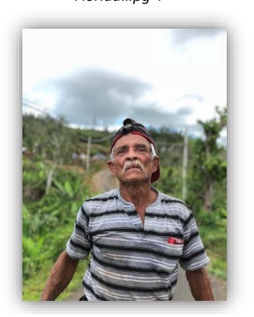
Seven Months After Hurricane Maria...Page 7