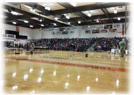
Students from Oregon and Idaho that attended the regional event