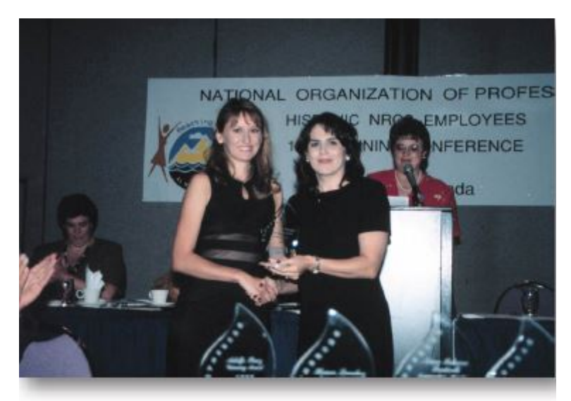
1999 Awards Banquet in Las Vegas, Nevada.

Also, if you plan on attending and have items from past conferences such as old programs, photo albums, pins, goody bags, etc., please bring them with you to display on a dedicated table during the Conference.