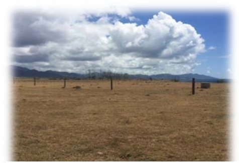
After Obstruction Removal provided by NRCS Juana Diaz, PR

that everyone did, we witnessed the appreciation of the producers. The words and actions of the field office staff and Puertorrican people made me proud to be part of the NRCS agency.