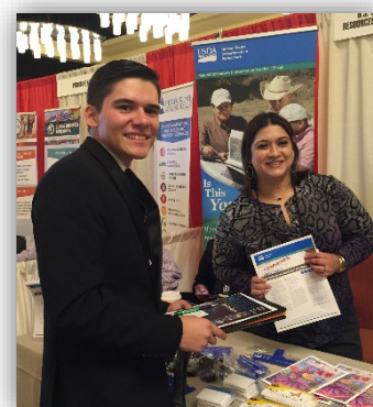
Hispanic Association of College and Universities...Page 3