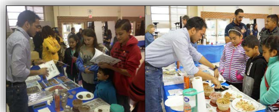
World Soil Day 2016 Event: Noche de Ciencias (Science Night) 7...Page 6