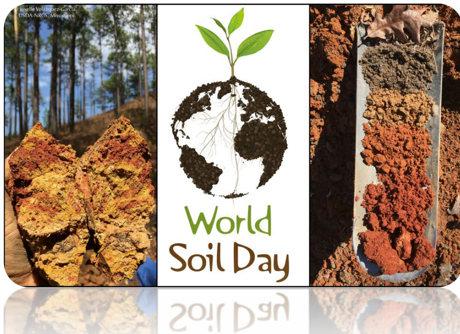
World Soil Day 2016 Event: Noche de Ciencias (Science Night)...Page 6