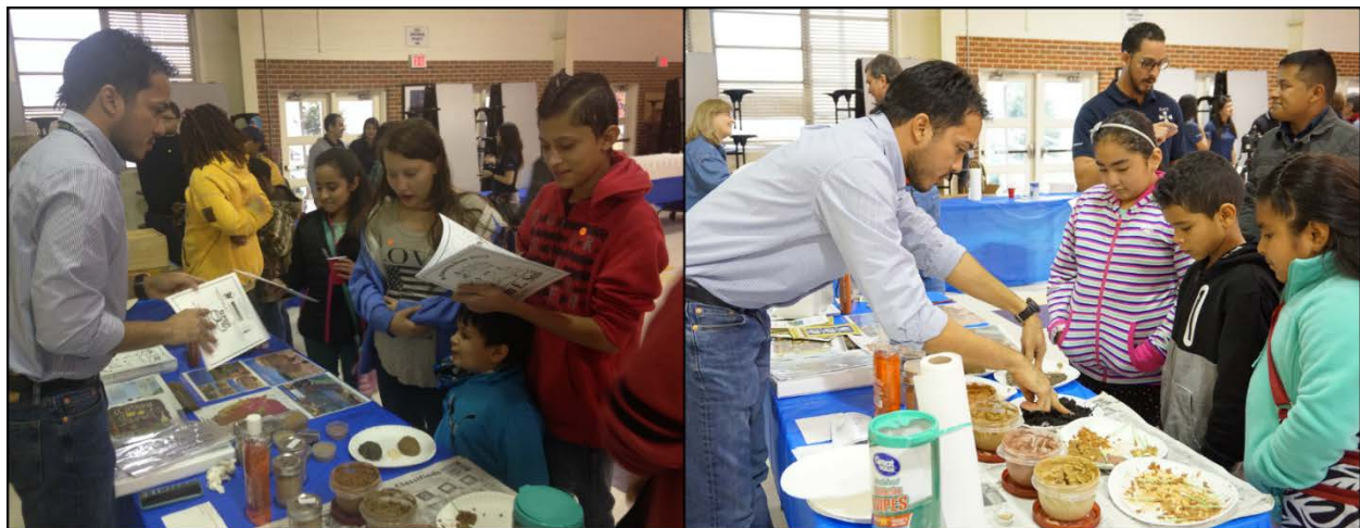
Informative pamphlets, brochures, posters, and Same E. Soil Coloring Book were distributed to the public.

The Canton community youth included a significant number of Hispanics. As a Hispanic and the HEPM for the state of Mississippi it was important for Hispanic youth to be exposed to soil science, natural resources, and the NRCS agency. I believe this event will continue to foster the minds Hispanic students and direct them into the fields of science, technology, engineering, and math.