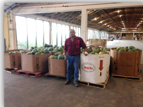
NRCS Employees Go Above and Beyond to Feed Families...Page 5